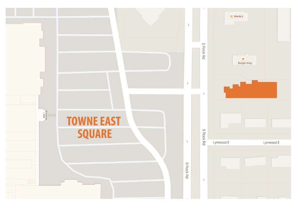
Rock Road Suites Master Site Plan