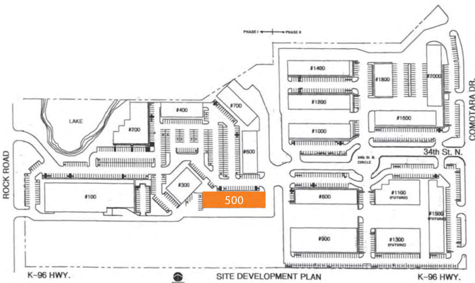
Northrock Business Park Master Site Plan