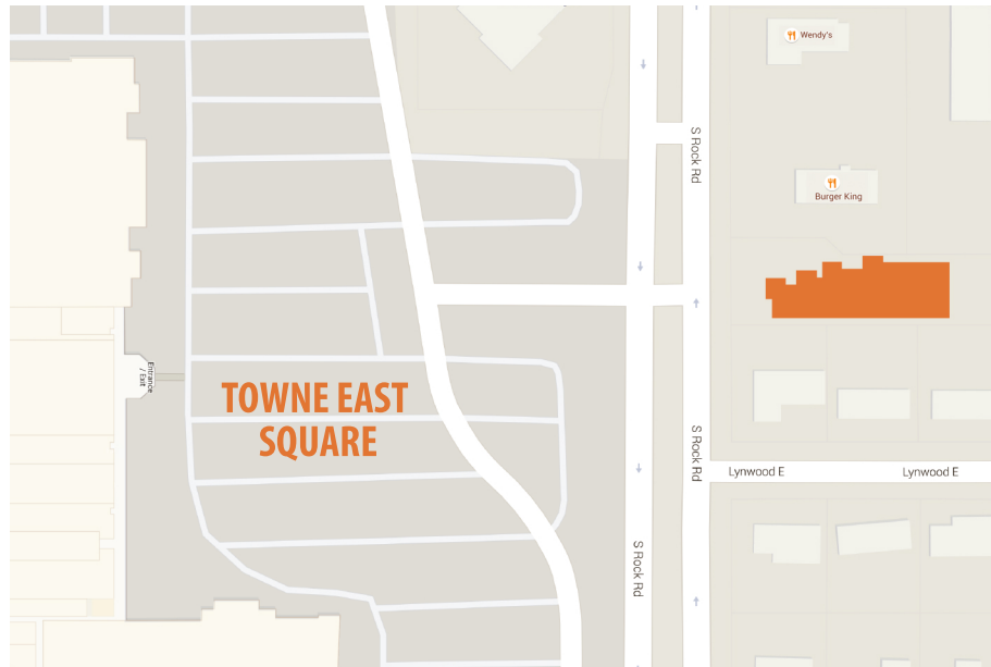
Rock Road Suites Master Site Plan